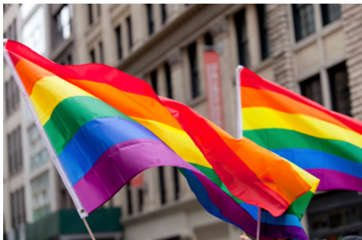
LGBTQIA+ Community in Action

Some of the actions we have taken here in GSA is to inform the Cardigan Community about the LGBTQIA+ community and how it is being affected by the world we live in. Recently we have discussed themes such as the Covid-19 pandemic, the Pope announcing his support of same sex civil union, and the recent Elections. One of the things we have also done in GSA is to teach the Cardigan community how to help and respect the LGBTQIA+community.