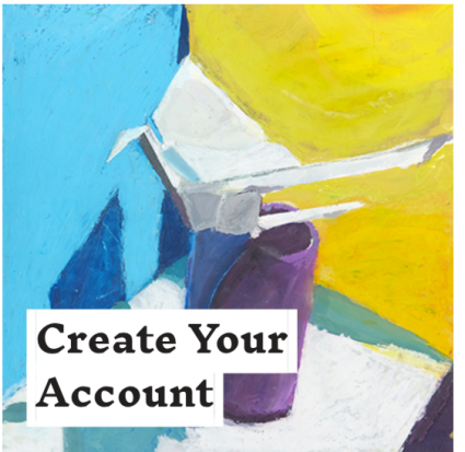
Scholastic Art Awards Homepage