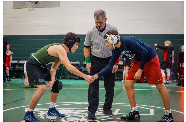
Above: Cardigan hosted Wrestling Tournament (unrelated to article), 2023.

It is good when Cardigan receives snow, when everything in my sight turns as white as milk and the world turns quiet and slow. Who can stop their will to have snowball fights, and wrestle each other to the white mat, then get up, faces full of white feathers, while our footsteps are silent, just like cats? We, just as pure, enjoy the snow together. But the lovely snow melts as rain falls hard, and, hopelessly, we drop our tears below. The water vaporizes from the schoolyard, the snow melts; the grass fills as droplets flow. The soft white blanket warmed us from the start— it fell from the sky and into the heart.